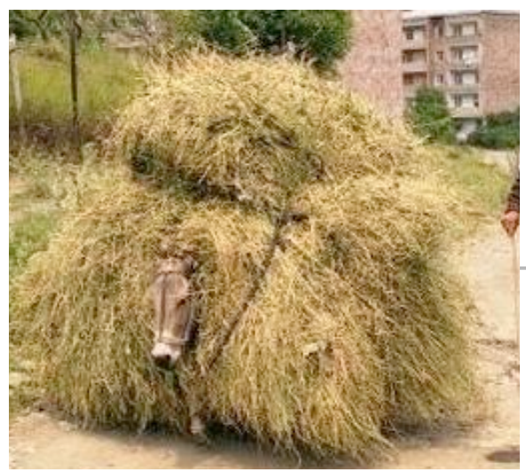
Figure 3: You, hard at work

The AD will work as hard as a this donkey (Fig 3) and might feel a little overwhelmed at times (Fig 4), but it will always work out, we are planning institutionalized fun after all. The AD is paid for 10 hours of work per week in the winter, 20 hours/week during the spring, and 40 hours/week during the summer. Nobody gets paid while Trips is happening. In general, no one gets paid very much to create Trips, and the AD is no exception. What's more, it's expected the AD will be willing and eager to put in time far beyond their compensated hours (especially around Trips time).