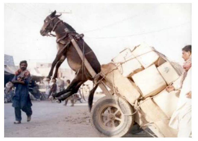
Figure 4: You, slightly over loaded with work

The news isn't all bad, though. It is also expected that Trips 2012 is going to be really fun, and that putting in extra hours might be fun as heck. Remember, you get to hang with me! (woo!) If you're willing to put in the hard work, it will be worth it.